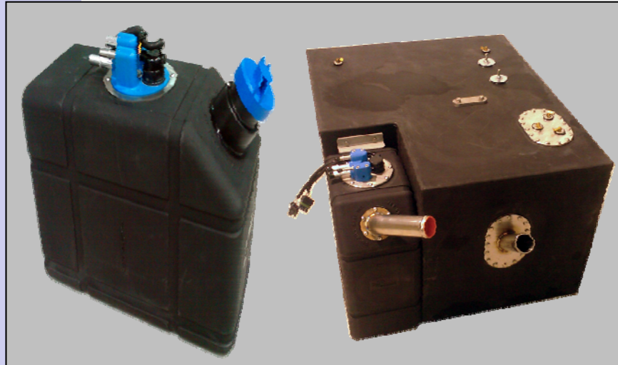
Example of. typical DEF Reservoir System

In order to meet reduced Nitrogen Oxides (NOx) emission levels, many diesel engine manufacturers have turned to Selective Catalytic Reduction (SCR) as the technology of choice. Storage, monitoring, and transfer of diesel exhaust fluid (DEF) is best handled with a single source solution.